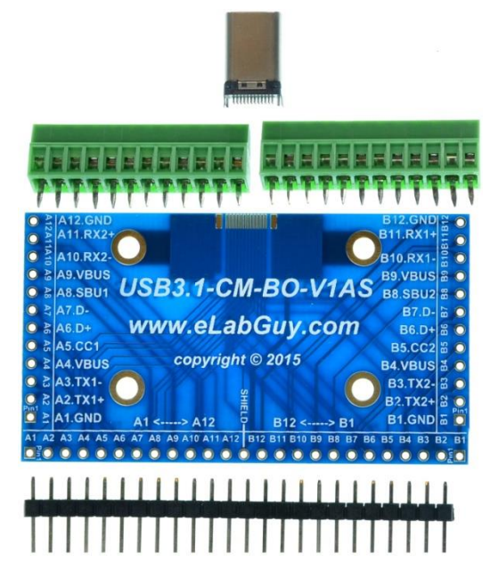
Figure 1: Parts inside the kit (Note: the module is not assembled, user can decide which connector to use on the module.)