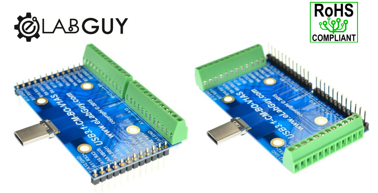
Figure 3: USB3.1-CM-BO-V1AS with terminal blocks on back